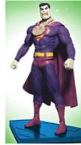
Bizarro $10 (Pretty sure they will eventually come out with a more Superfriend/Silver Age styled one, which I would prefer anyway.)