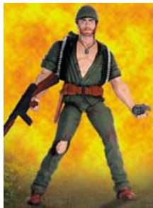
Sgt. Rock $16 (I'm guessing that they will eventually get around to a Jonah Hex Figure and I think Sgt Rock would look good next to him.)