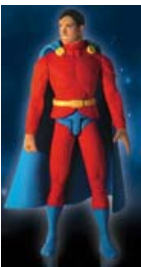
Monel $ (Still pretty common but I don't want enough to pay full price)