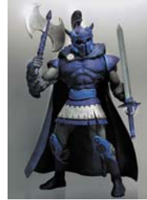
Ares $16 (eh... something has to be last.)