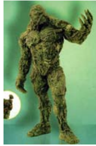
Swamp Thing $20 (+S) (Extremely unlikely at this price. Very rare figure. But I bought Man-Thing after the Bad Sci-Fi movie... so he would go nicely with him on the shelf)