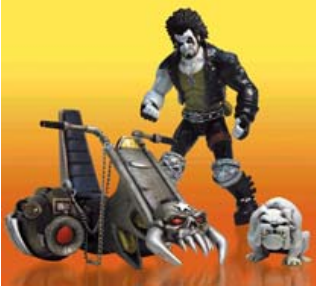
Lobo $45 (You could set him on the shelf next to Wolverine, Nuff said.)