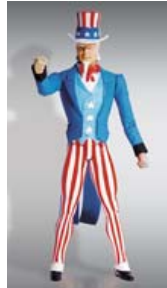
Uncle Sam $12 (No desire to get other members of Freedom Force... but every time I see this figure I think of the Alex Ross Poster.)