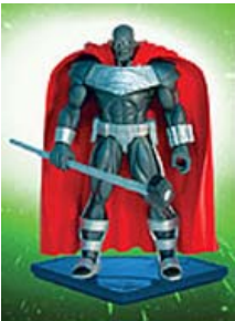
Steel $15 (Actually the JLU cartoon has generated some interest in this character for me, plus DC has so few cool black heroes.)