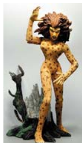
Cheetah $10 (She's shown up in Flash recently. Could always use a few more female villains for the shelf.)